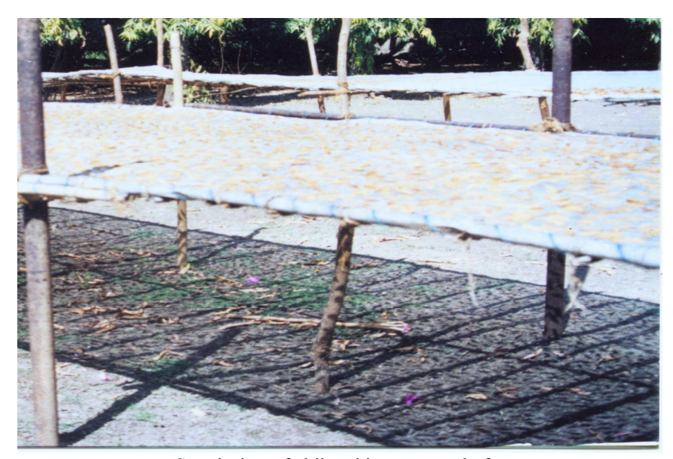
Sun drying of chiku chips on net platform

In the beginning 1996, they prepared 100 Kg chiku chips, for that they brought 1000 Kg chiku fruits @ Rs. 2/-. First two years it was on pilot basis project then it is increasing chiku chips production steadily. The women club prepared various chiku products and sells them such as chiku chips, chiku powder, chiku vadi, chiku choklets, chiku pickles etc.